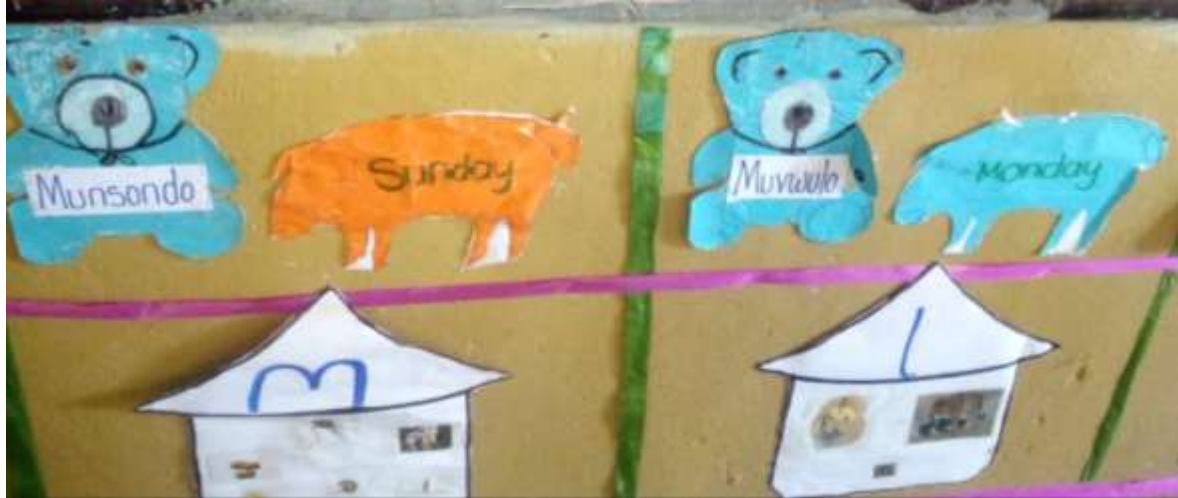
Figure 1: Days of the Week in Chitonga

of the days of the week in both English and the language of instruction (Tonga). The following chat was used to demonstrate the days of the week.