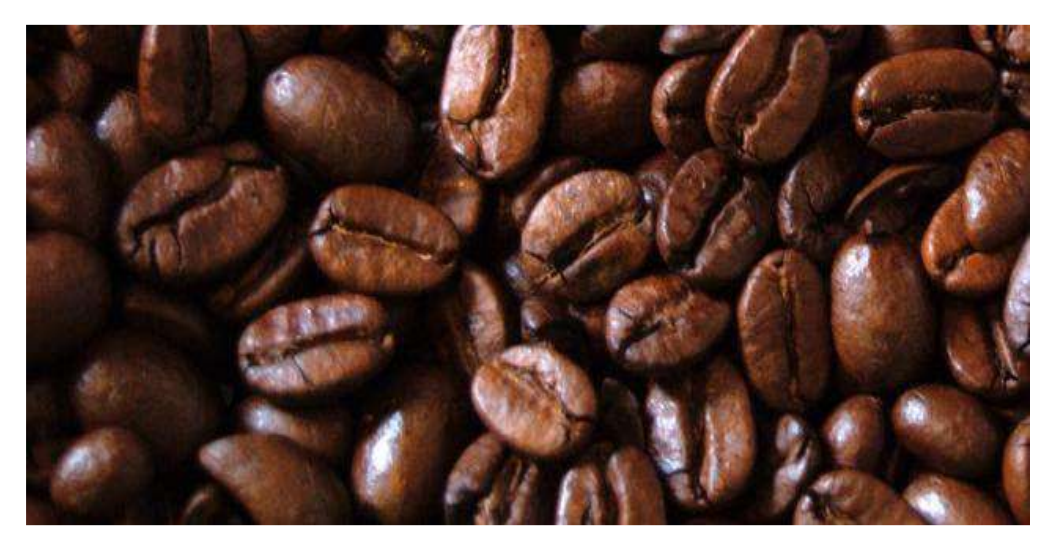
Figure 2: roasted coffee

Oromo believe that whenever the coffee ceremony takes place properly, Waaqacomes nearer to them and would give them peace and whatever else they need. Coffee ceremony would also serve as a forum to reconcile quarrelling parties. Furthermore, not attending of coffee ceremony by invited neighbor is/was a sign of disrespect and gap between the invited and the inviting. Items needed are may be vary from rural to urban areas and from family to family, it depends on economic capacity of the households [22]. While roasting, coffee emits its aroma and the roasted coffee beans are shaken turning a dark brown and its wonderful smells moved around invited individuals. For instance, roasted coffee is presented to the head of household it, it believed he may face good luck. The roastedcoffee to smell are crushedbymortar(mooyyeebunaa) and small pestle (ilmoomooyyee) and coffee powder boiled in the jabanaa . The powdered coffee is/was added to boiled water into coffee pot ( jabanaa )[ 23 ].