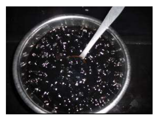
Figure 4: Buna qalaa ready for eating

In addition, the women who are hosting the ceremony often hold up hot jabanaa on their palms and pray: 'Ateetee Gubaansiif baadhagubaa nu oolchi, Ateetee (I am carrying hot for you glory, protect us from hot), Guutuusiif dhaabna guutuu nuufgodhi, (We rise full for you make us full) ''[35]