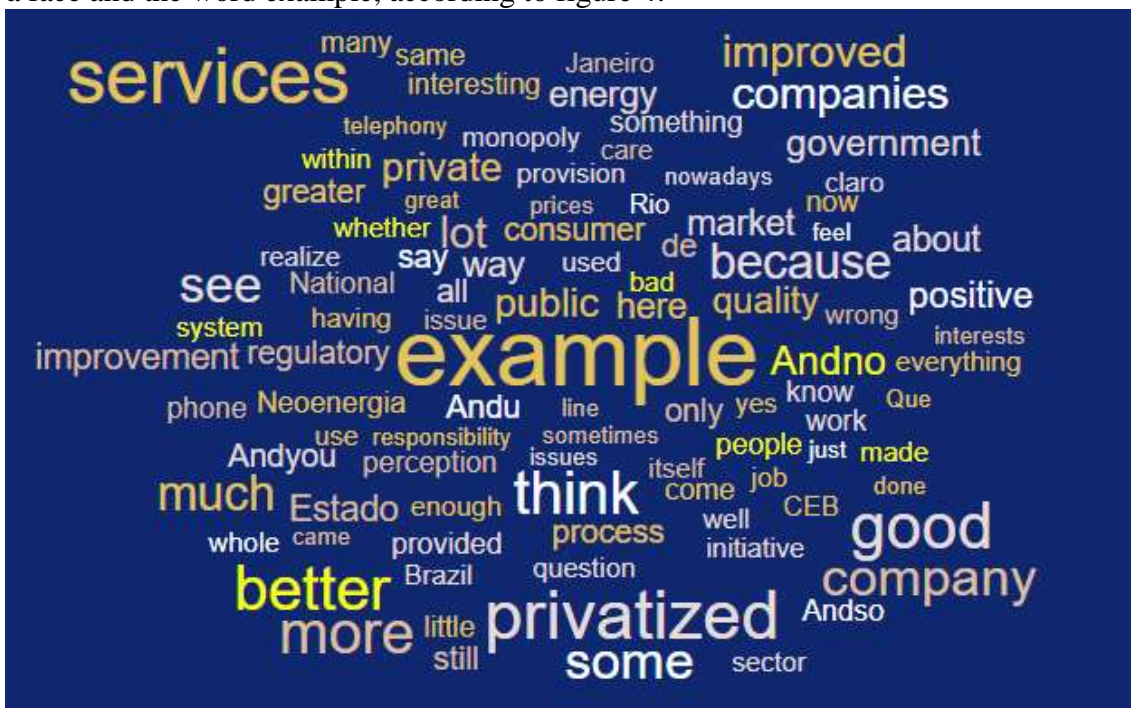
Figure 4 Word Cloud (Question two).

The second question of the interview "What is your perception of privatized services?" has as a face and the word example, according to figure 4: