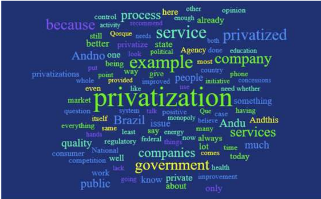
Figure 2 Word Cloud.

Figure 1 shows the entry “privatization” as the leading frequency. Next, Figure 2 depicts the word cloud of the dataset: