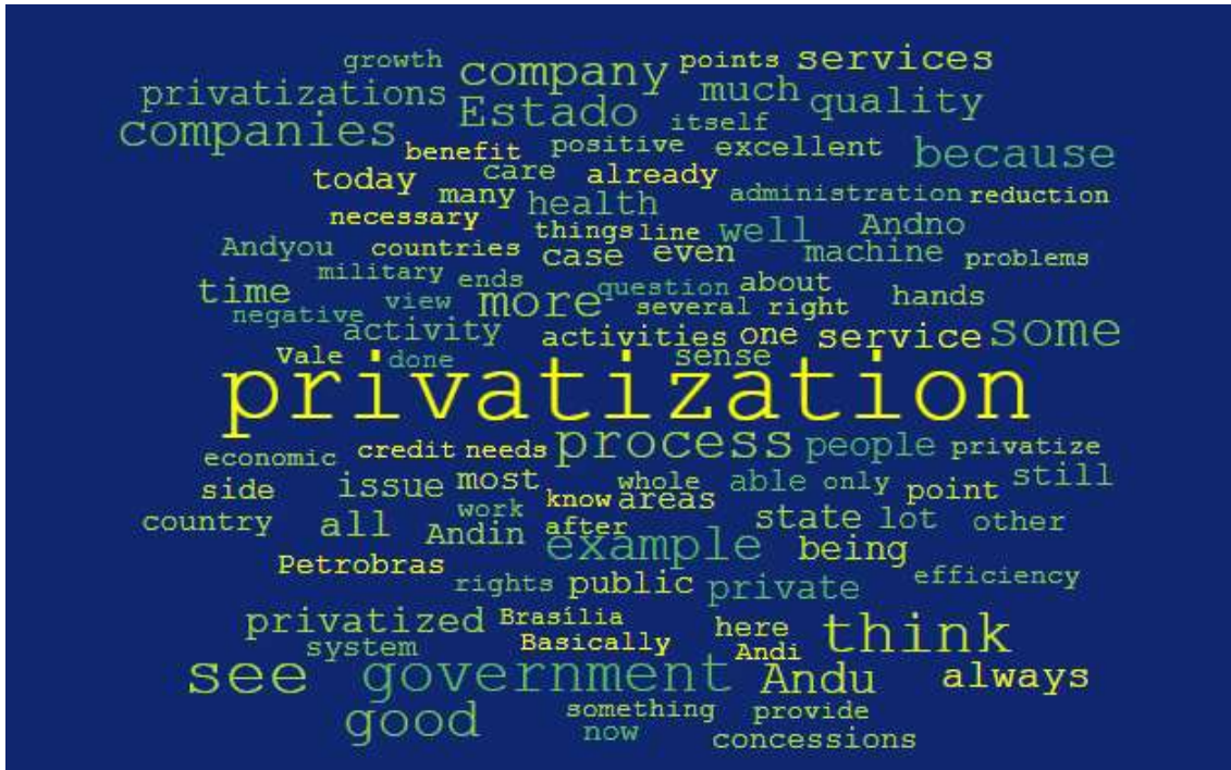
Figure 3 Word Cloud (Question one).

The second question of the interview "What is your perception of privatized services?" has as a face and the word example, according to figure 4: